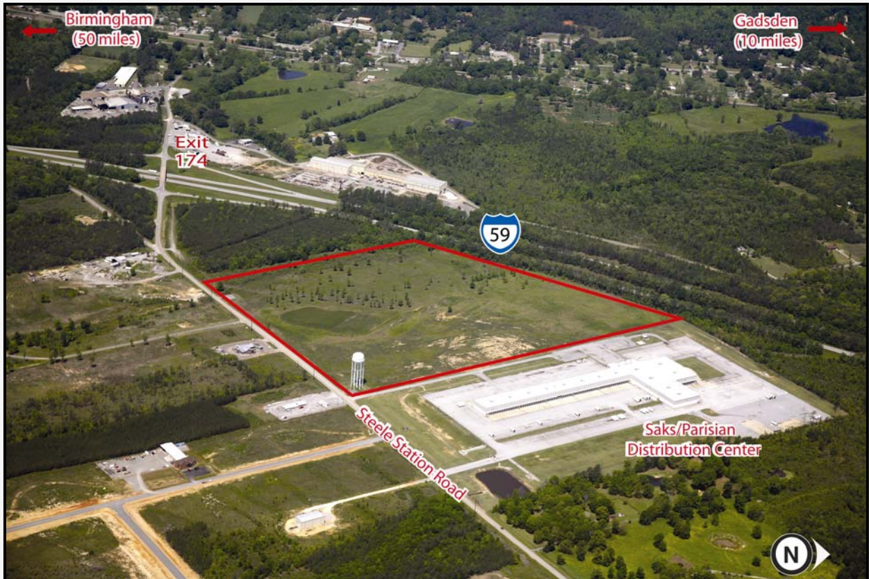
Water Tower owned by the City of Steele